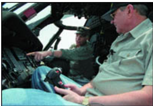
(Pictured with Author Tom Clancey, showing him the instrumentation on his Blackhawk helicopter, circa 2002)